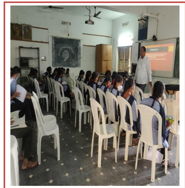
Lecture on listening skills