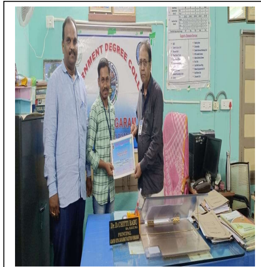
Distribution of Certificates